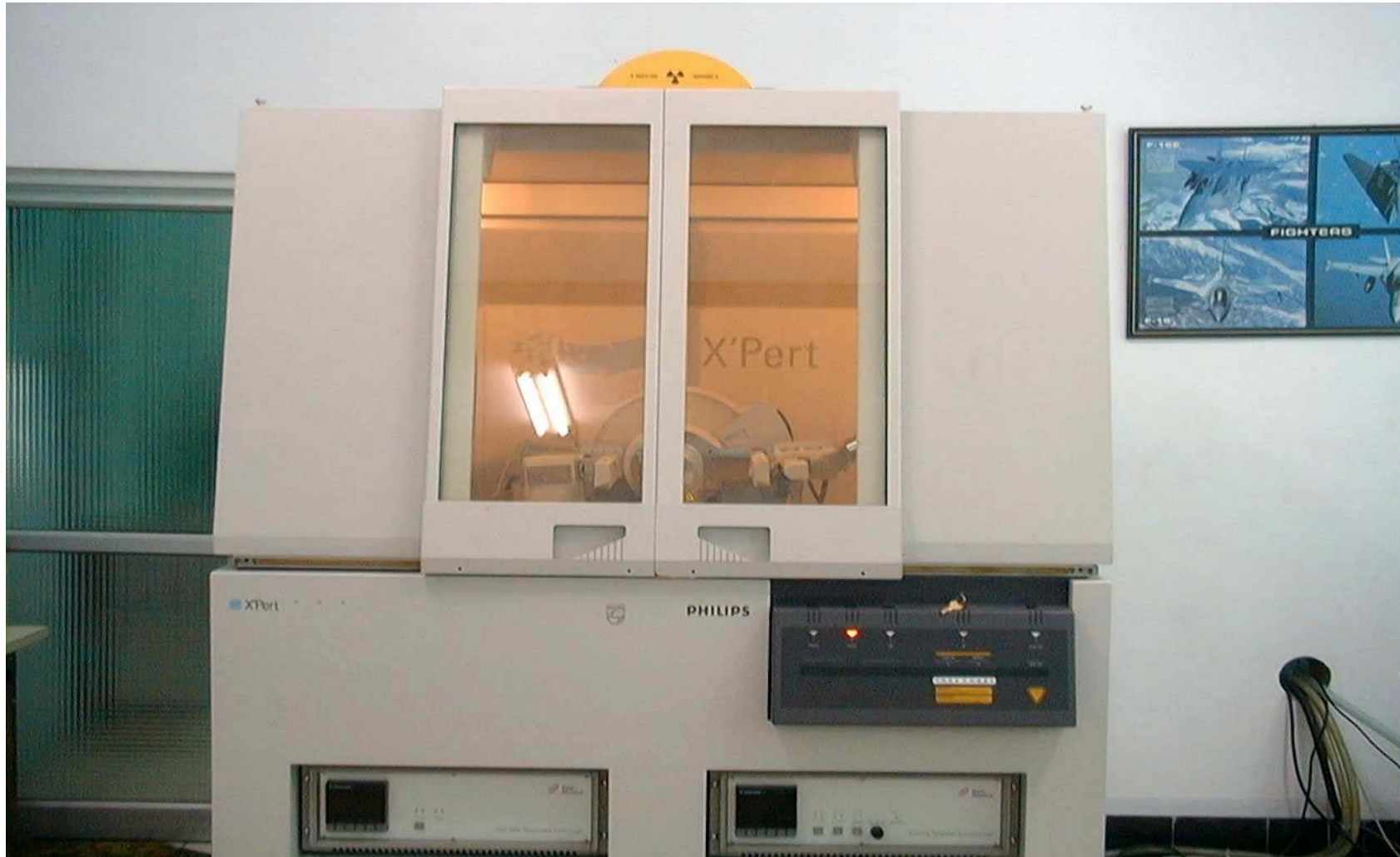
X-ray High temperature and high pressure X-RD analyzer, PHILIPS.