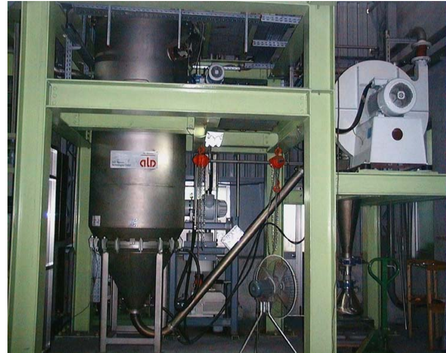
ALD gas atomizing