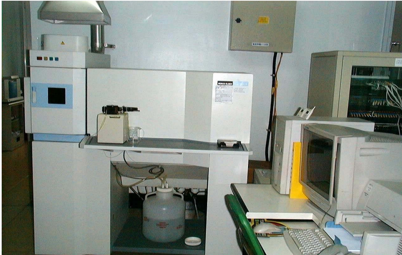
ICP-Emission spectrometry , PERKIN ELMER, OPTIMA 3200L.