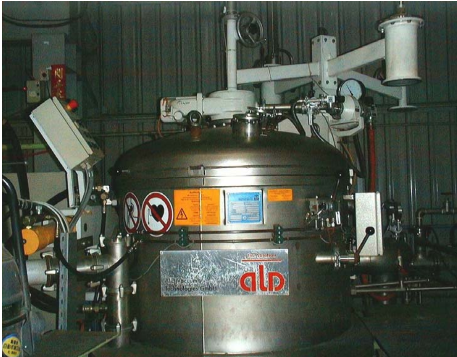
ALD Vacuum melting