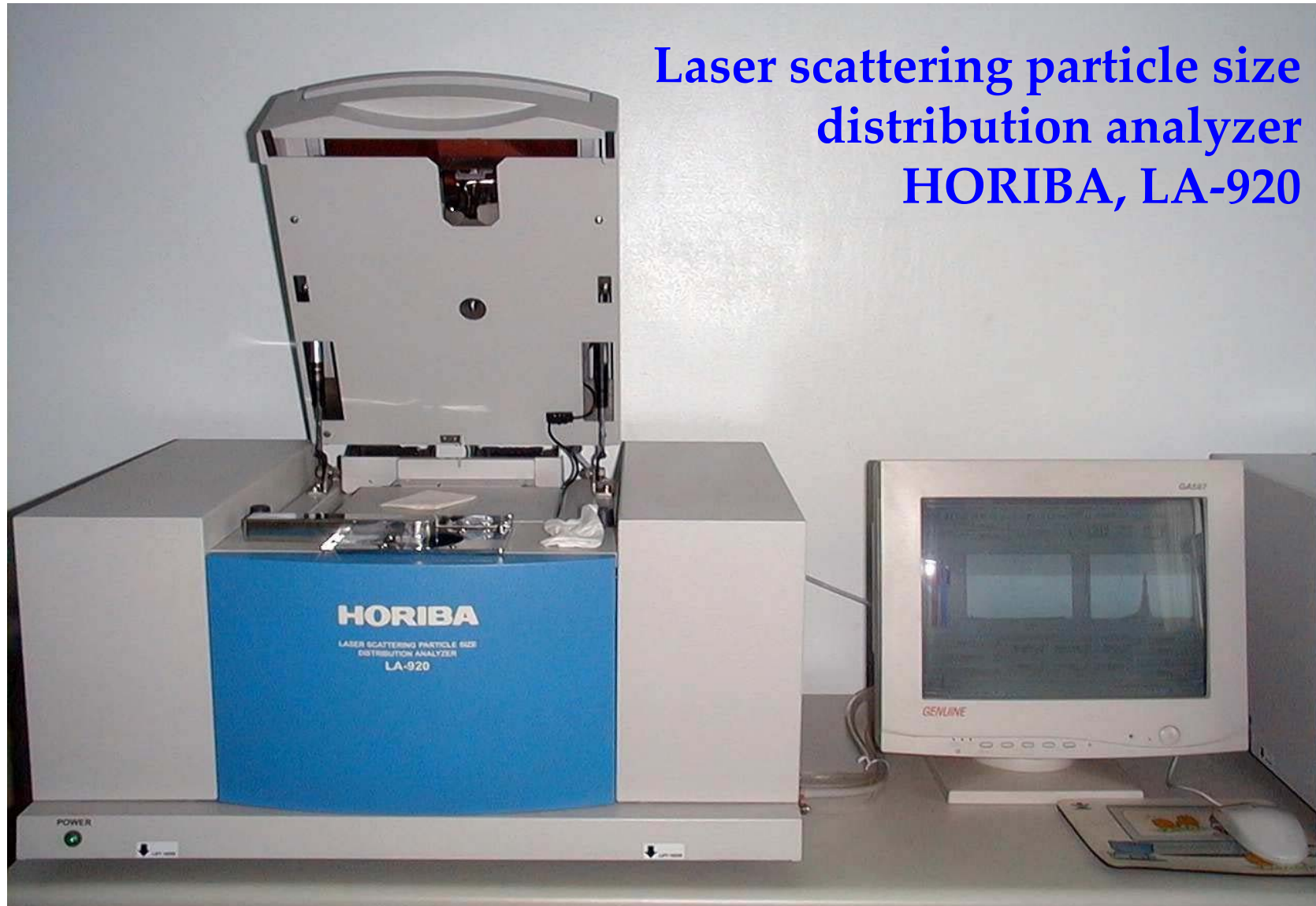
Laser scattering particle size distribution analyzer HORIBA, LA-920